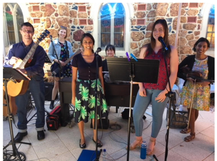
Some of the musicians getting ready to start our worship time