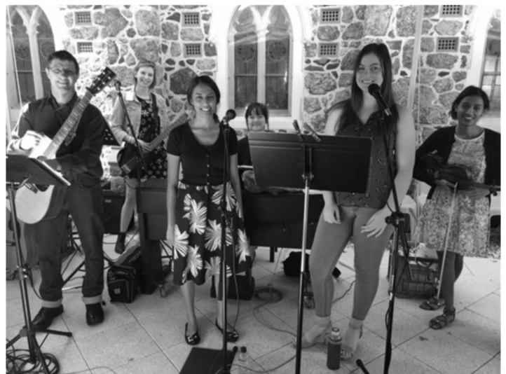
Some of the musicians getting ready to start our worship time