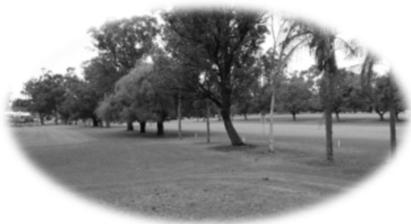
Embleton Golf Course - Home of Epiphany Cup 2018