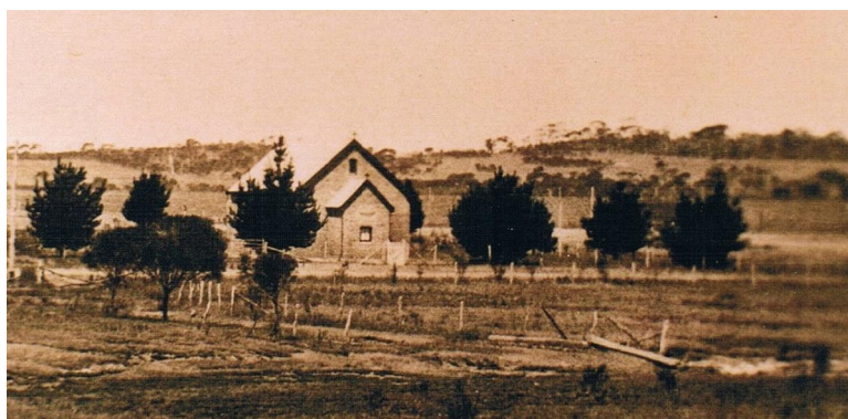
Left Trinity Lutheran Church at 'Langesville' Wardering, now called Ockley