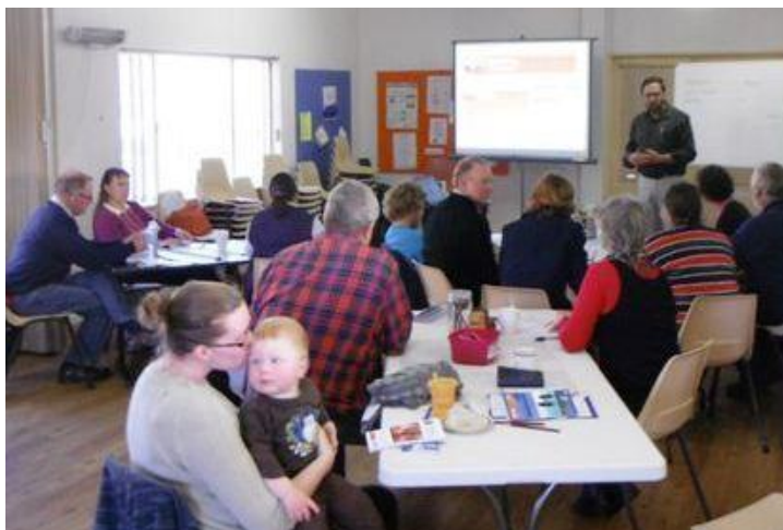
Esperance Training Day

Thanks to Pastor for organizing this seminar for our Parish.