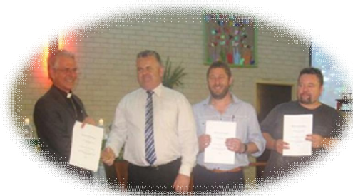
Handing over the Ministry Understandings Documents