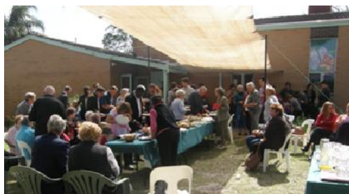
Some of the 150 people who gathered to give thanks to God (above)

A great thanks to God for his mercy in enabling Bethlehem, Morley to be a blessing in our community. God is GOOD.