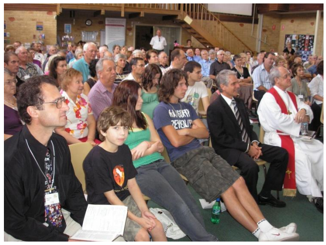
And this is all of us (well, nearly).