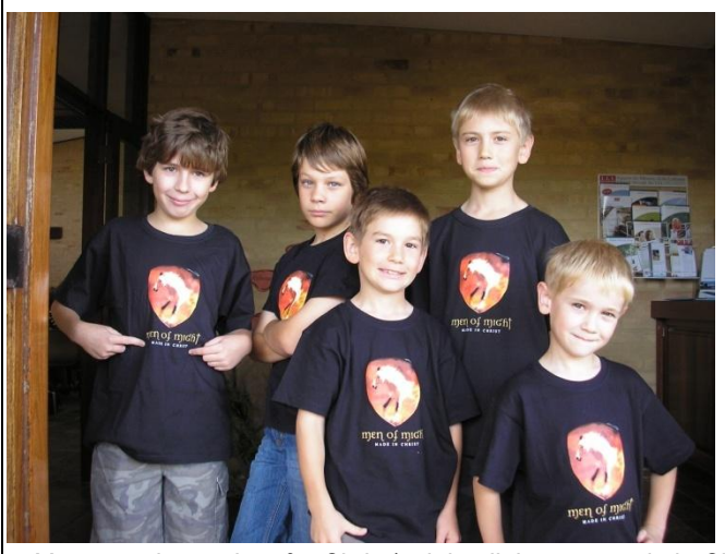
Young ambassadors for Christ/ mighty little men made in Christ.