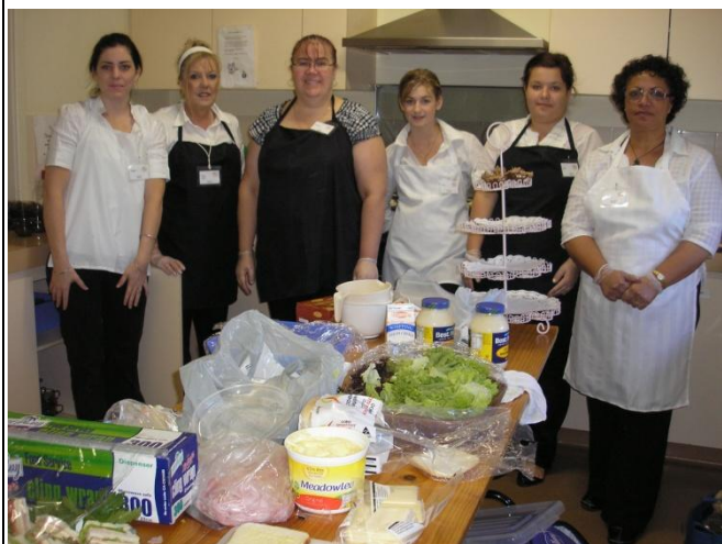
Girls from Ocean Keys – Catalyst, catering for lunch on Saturday.