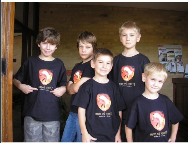
Young ambassadors for Christ/ mighty little men made in Christ.