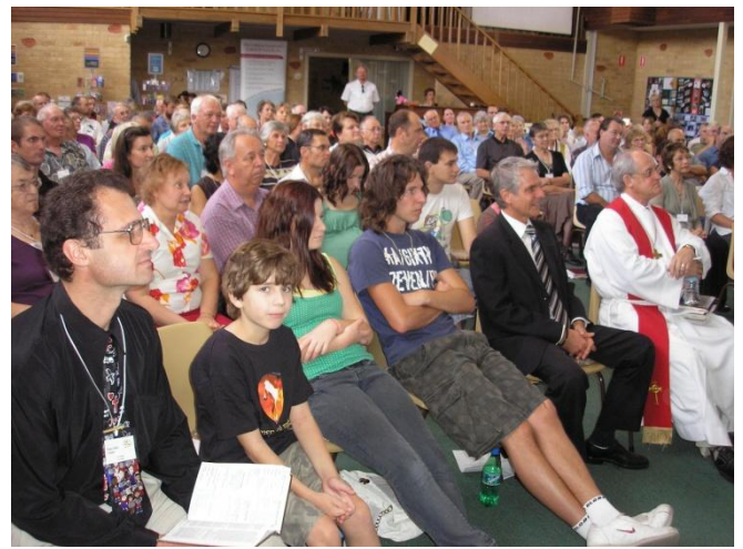
And this is all of us (well, nearly).