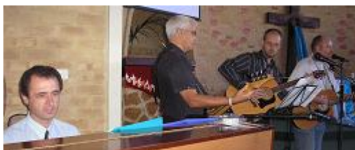
Pastors from the district leading the worship. What a band!

And now 17000 words (a picture speaks for a thousand).