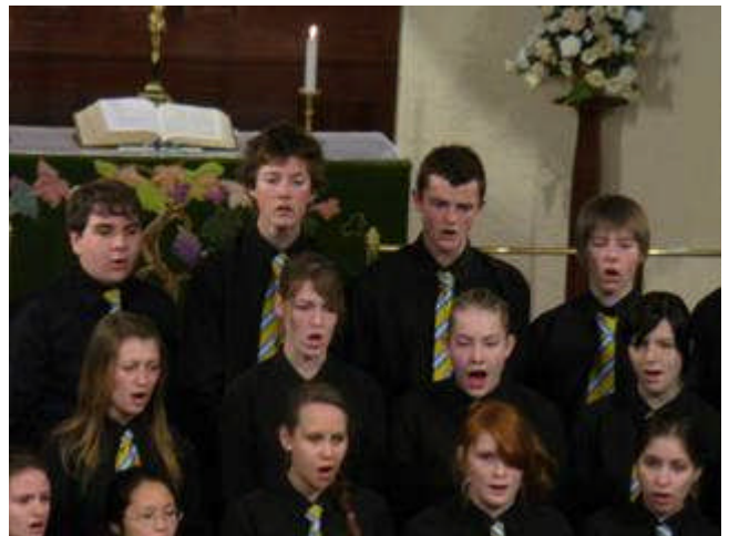
Immanuel students lead the worship